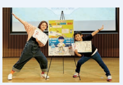
Recipients of the Furuno Electric Award