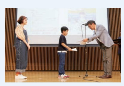
Furuno Electric Award

In this contest, art students create infographics from elementary school students' free research on the oceans.