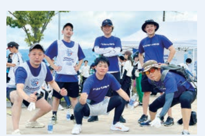
Two teams from FURUNO

01 Overview of FURUNO 02 For a Sustainable Growth 03 Segment Overview 04 Foundation for Growth 05 Together with Society 06 Financial and Non-financial Data