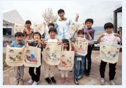
The one and only original eco-bag in the world