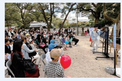
Community event at Nishinomiya Shrine