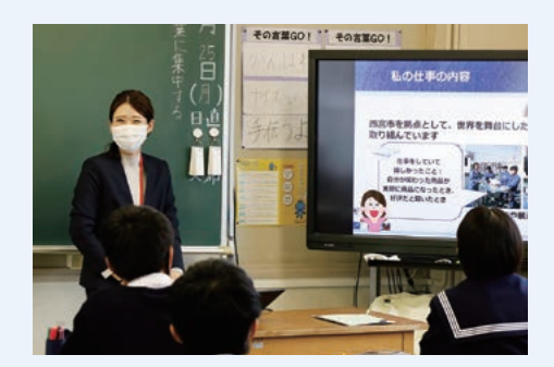
Seido Junior High School (Ashiya City)

In this program, women with science backgrounds share why they chose their careers, the content of their current jobs, and the satisfaction they find in their work.