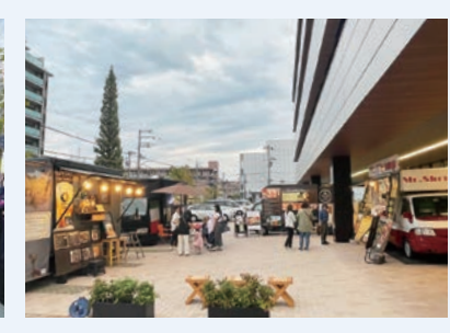
The view with Food Trucks in front of SOUTH WING