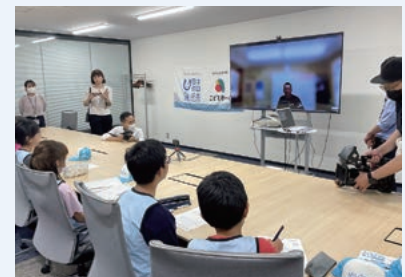
Online interviews with fishermen