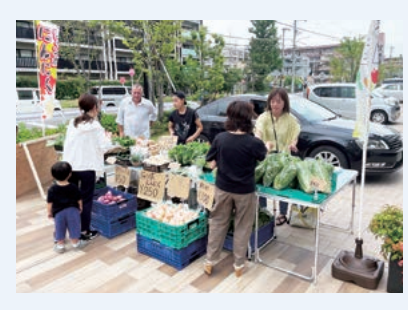
Fresh vegetables for sale