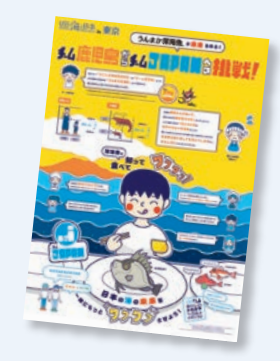
Furuno Electric Award Infographic Poster