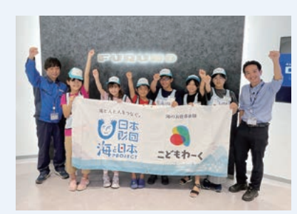
Children and employees in the role of lecturers

from the sea," and is having children experience work related to the sea.